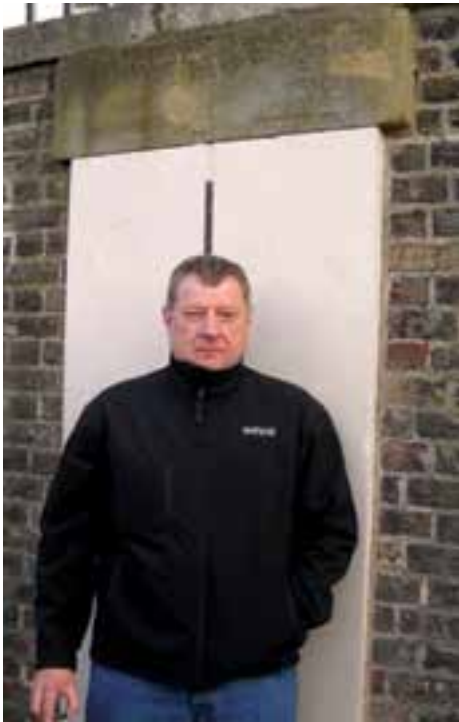
The plaque above me is inscribed "Greenwich Meridian" with "East Longitude" over my right shoulder, and "West Longitude" over my left shoulder.

I want to share with you my adventure visiting the Prime Meridian at Greenwich in London, UK.