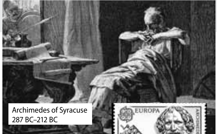
Archimedes of Syracuse 287 BC–212 BC