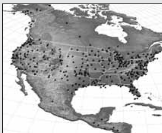
The CORS system continually collects GPS signals and provides these data to GPS users via the Internet for precise positioning activities.

NOAA understands and predicts changes in the Earth’s environment, from the depths of the ocean to the surface of the sun, and conserves and manages our coastal and marine resources. ◉